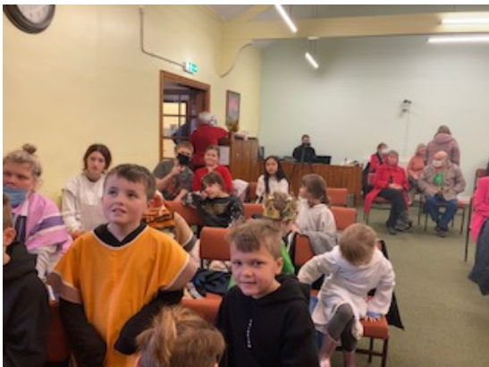
Family Christmas service