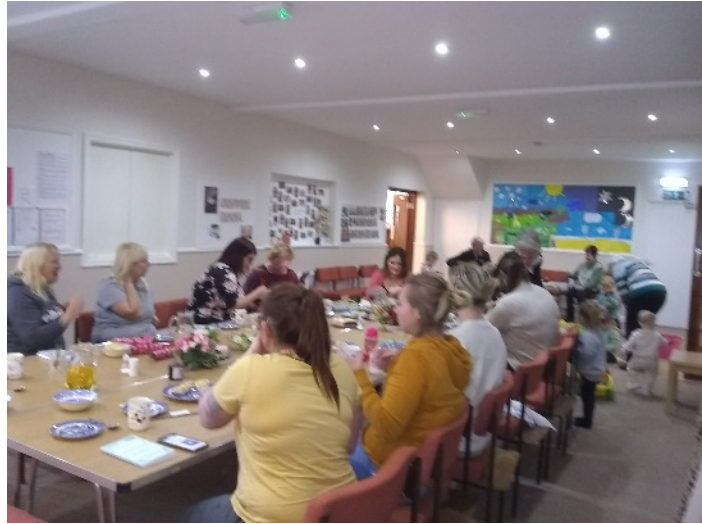
Mums from Tots and Co enjoy Christmas Lunch