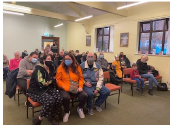
Family Christmas service