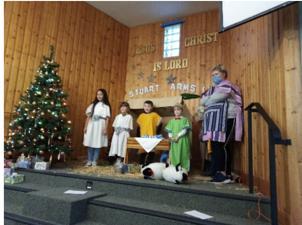
Family Christmas Service