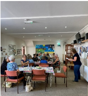
Ladies Christmas Lunch